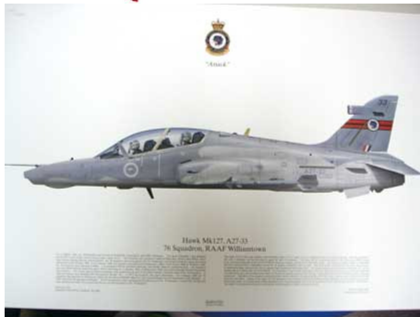
HAWK PRINT - $15.00