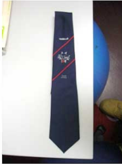
SQNTIE - $20.00

I am looking forward to hearing from you and I will attempt to enter some interesting articles from the squadron's history in the newsletter in future.